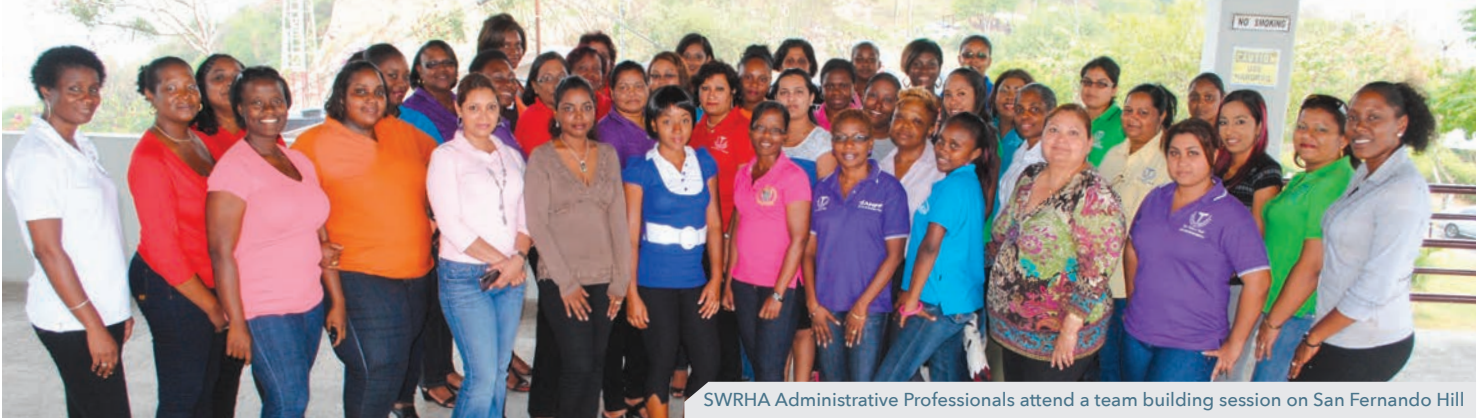
SWRHA Administrative Professionals attend a team building session on San Fernando Hill

The contribution of administrative professionals to the daily operations of the South-West Regional Health Authority (SWRHA) cannot be measured. Every year during the month of April these diligent employees are recognized for their service to the SWRHA. This year this professional body of staff was sent to a one day Team Building Workshop on the scenic San Fernando Hill on Wednesday 24th April and north coast beaches and Avocat Waterfall on Friday 25th April 2013. These activities gave them an opportunity to meet and share knowledge with their counterparts in an informal setting. We say thank you Administrative Professionals because you are the backbone of our organization!