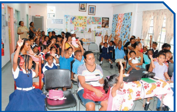
Children participating in a question session about their safety