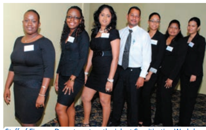
Staff of Finance Department on the job at Sensitization Workshop for Suppliers and Contractors