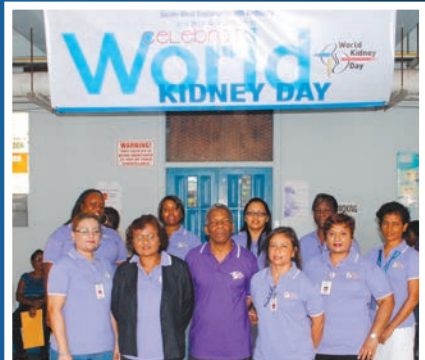
Haemodialysis Unit of SFGH celebrates World Kidney Day 2013