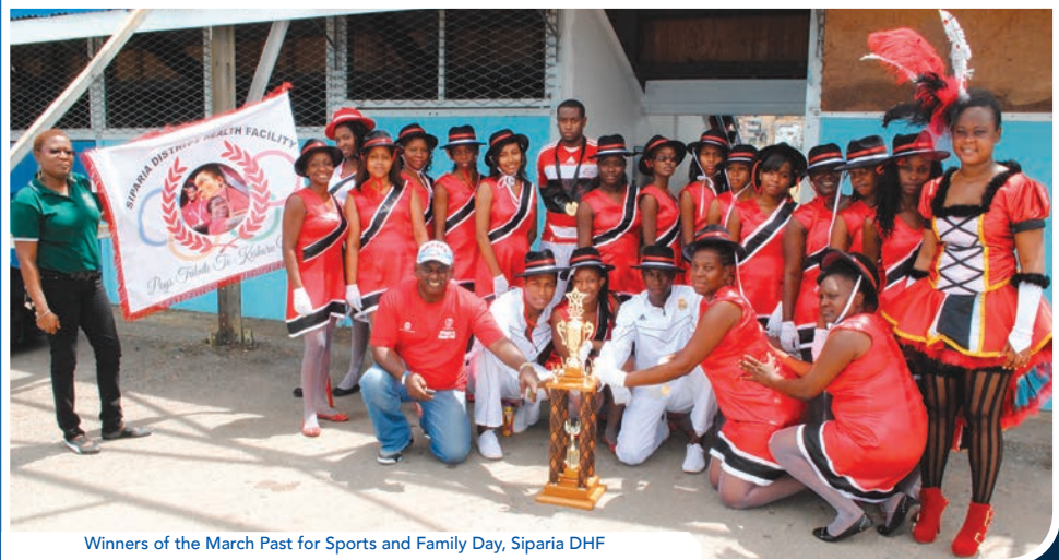
Winners of the March Past for Sports and Family Day, Siparia DHF