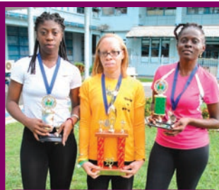
Top 3 Female Runners