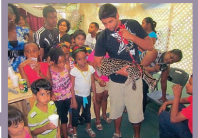
Kids viewing the Ocelot