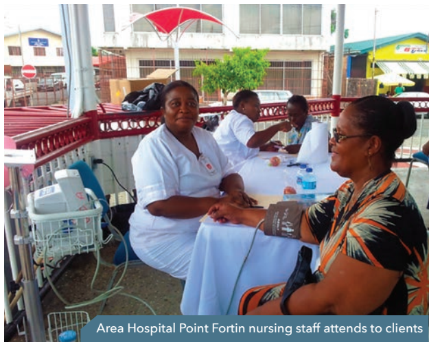
Area Hospital Point Fortin nursing staff attends to clients

To commemorate International Nurses' Day on 12th May 2013, the Office of Nursing Administration at Area Hospital Point Fortin showed appreciation for their nursing staff with a week of activities entitled Closing the Gap-Millennium Development Goals . The activities commenced with a celebration of nurses with cake and non-alcoholic wine on 12th May.