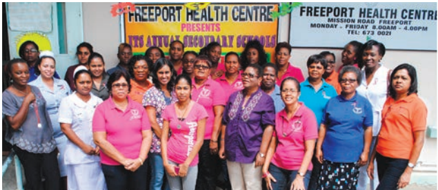
Staff at Freeport Health Centre at their Annual Secondary Schools Calypso Competition