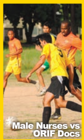
Male Nurses vs ORIF Docs