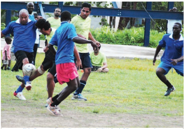
Globe Trotters vs. Supply Chain United at SWRHA Football Tournament prelims