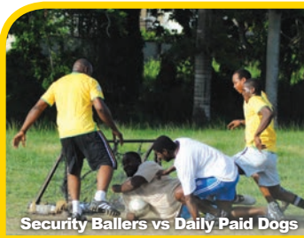
Security Ballers vs Daily Paid Dogs