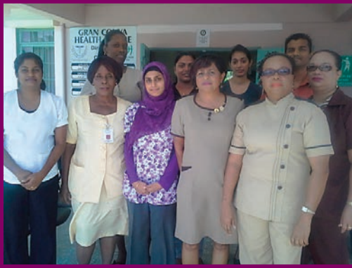
Staff of Gran Couva Health Centre

Staff members of the Gran Couva Health Centre hosted a health programme entitled “Women Take Control of Their Health,” on Thursday 28th February, 2013 at the Health Centre. The purpose of this session was to get women in the community to take more interest in their own health.