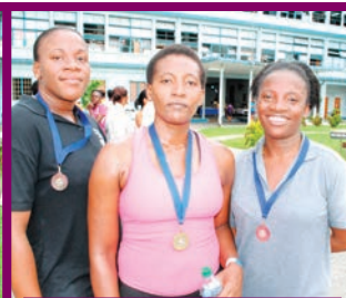
Top 3 Female Walkers