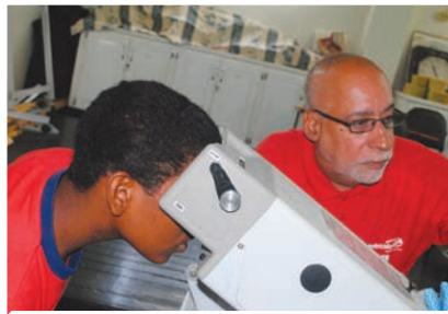
Vision screening at the Diabetes Easter Camp