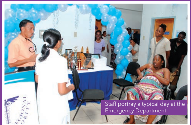
Staff portray a typical day at the Emergency Department

On June 17th, 2013, the Princes Town District Health Facility (PTDHF) celebrated their 10th anniversary; "a decade of Quality of Care" for the people of Princes Town and environs. To mark this milestone there was a week of activities. A health fair at the Out Patients' Clinic was held on June 18th. In addition, Pharmacy Awareness was held on June 20th and a Rewards and Recognition function on June 21st.