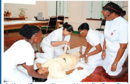
Accident and Emergency Nurses participate in Blunt Trauma From Falls Workshop at the Nurses Lounge