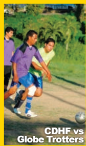
CDHF vs Globe Trotters