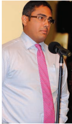
Top Photo: Finance and Supplier Chain Presenters.