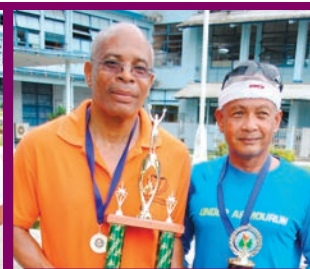
1st and 3rd place in Male Walkers