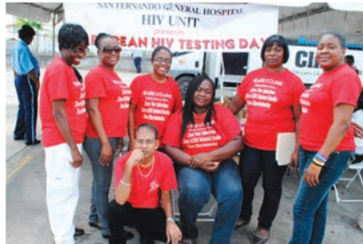
HIV Unit on the go at Caribbean HIV Testing Day